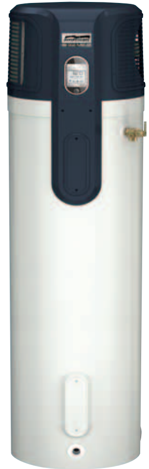
HPE6280H045DV Model Shown