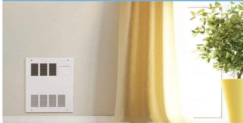
Recessed • W42 • W84 • W120