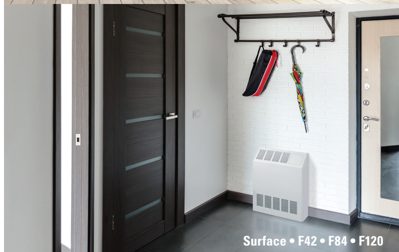
Surface • F42 • F84 • F120