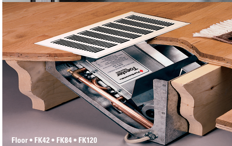
Floor • FK42 • FK84 • FK120